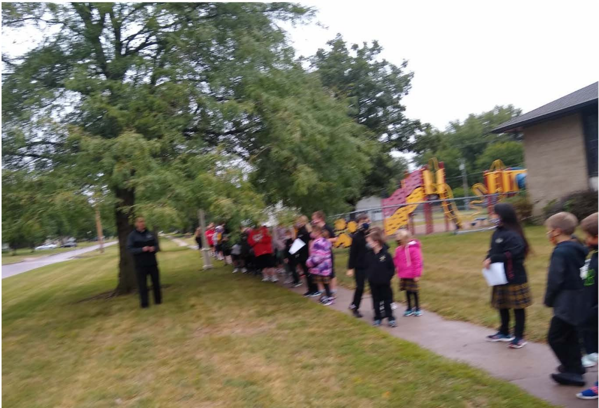
The second group got to try a walking rosary before their ice cream.