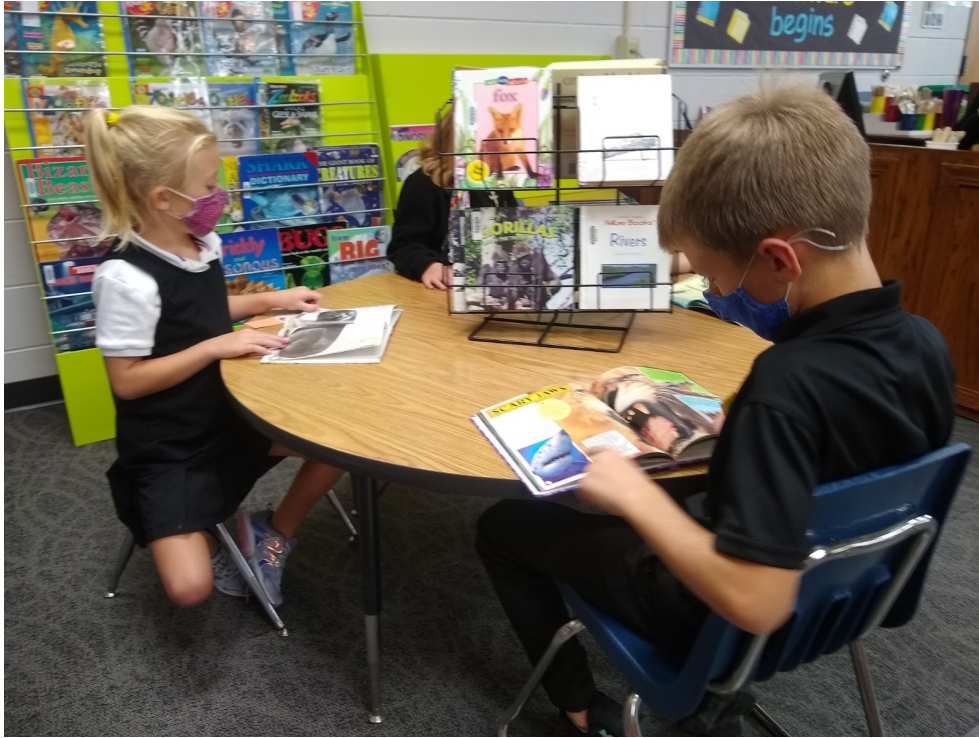
2nd Graders finding library books