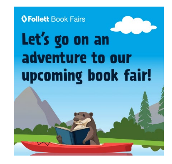
Teachers have wish lists for their rooms or the library, too! 25% of proceeds go to the library!

*Flyers will be coming home with students, too.