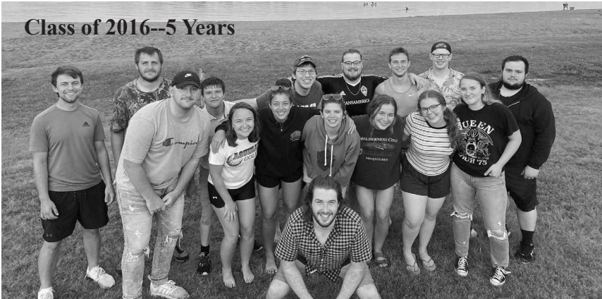
Class of 2016--5 Years