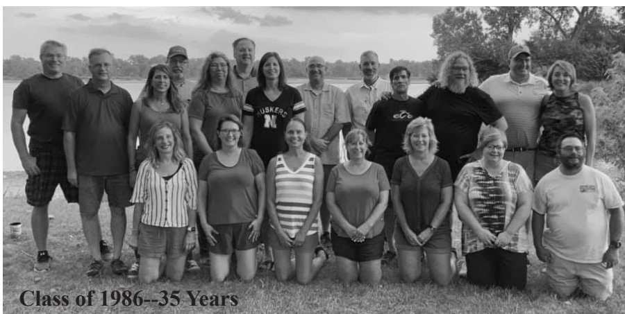
Class of 1986--35 Years