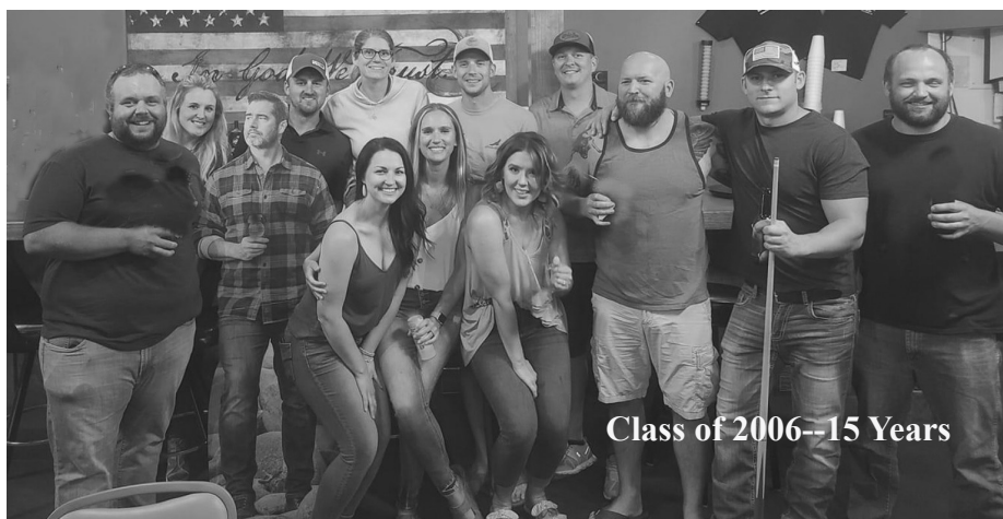
Class of 2006--15 Years