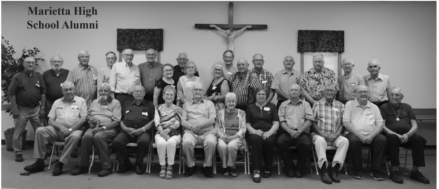
Marietta High School Alumni