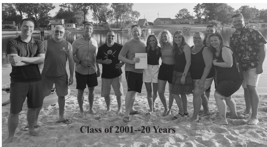
Class of 2001--20 Years