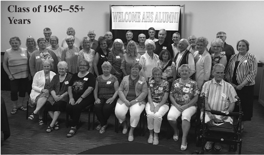
Class of 1965--55+ Years