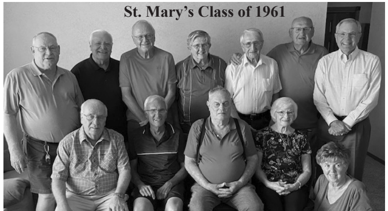
St. Mary's Class of 1961